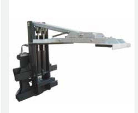
RIC - 360° bin rotator