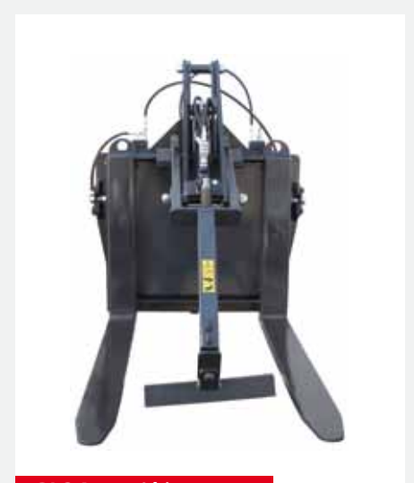
RLC.A - 180° bin rotator