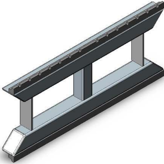
(Type CB3-5000 shown above)

The type CB Universal Carriage is a weld on unit suitable for all machinery and agricultural applications where Fork Tines are to be fitted. Manufactured from high grade steel in accordance with AS2359.11, this Carriage is precision machined to suit either Class 2 or Class 3 Fork Tines. The Safe Working Load (SWL) of this unit varies between 1.5 & 5 Tonne at a Load Centre of 500mm depending on type chosen – refer chart below. These units are supplied unpainted.