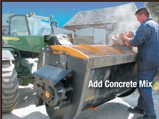
Add Concrete Mix