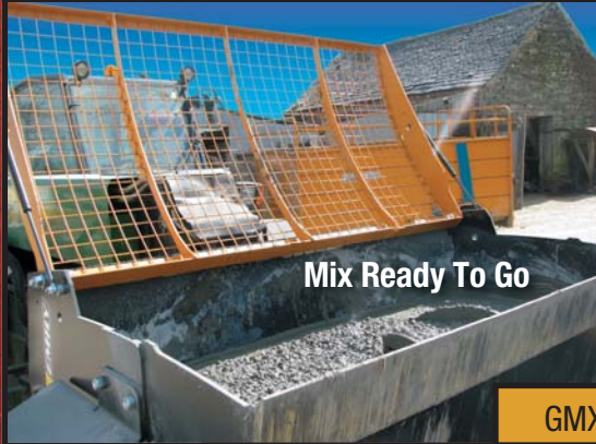
Mix Ready To Go