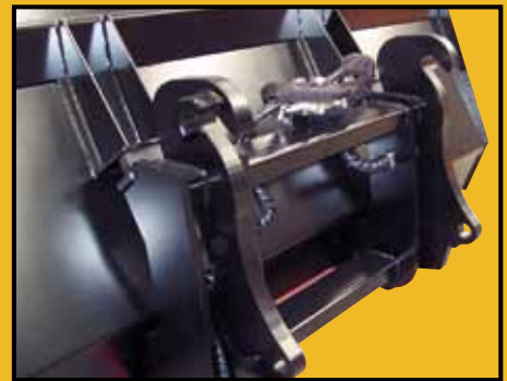
• Hydraulic cushion cylinders