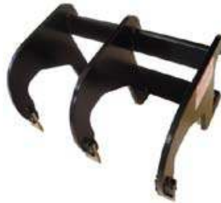
Mini Ripper also available