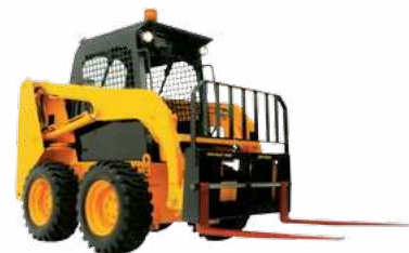
Pallet Forks also available

Contact your local professional dealer or contact Digga direct