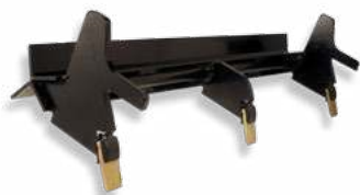
Kwik Rips also available