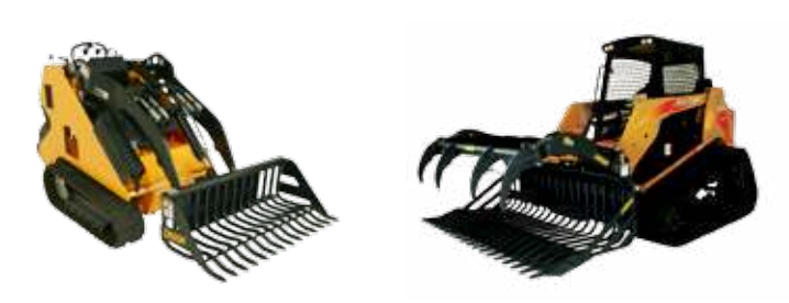
Rock Bucket and Rock Bucket with Grapple also available for Skid Steer Loaders and Tractors