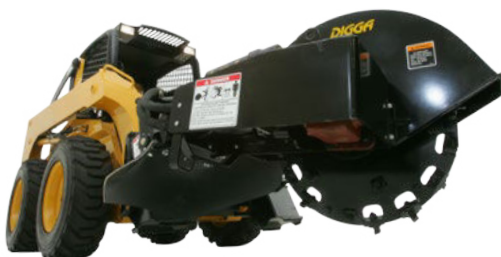
STUMP GRINDER ALSO AVAILABLE

Contact your local professional dealer or contact Digga direct