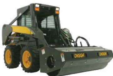
Vibratory Roller also available