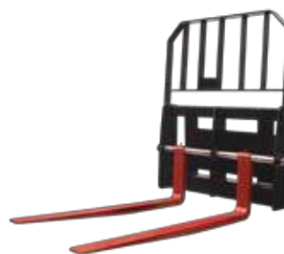
Mini Pallet Forks also available

Skid Steer Loaders, Front End Loaders and Telehandlers