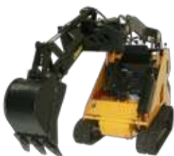
Mini Hoe also available