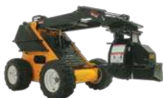
Mini Stump Grinder also available