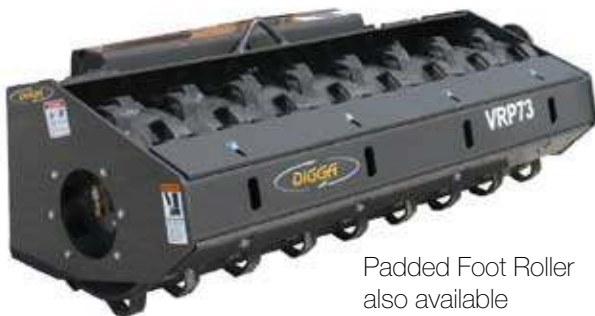
Padded Foot Roller also available