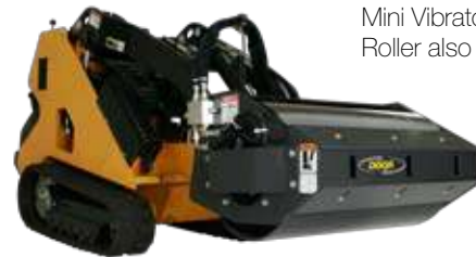
Mini Vibratory Roller also available