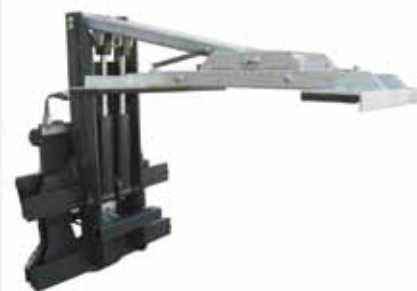
RLC - 360° bin rotator